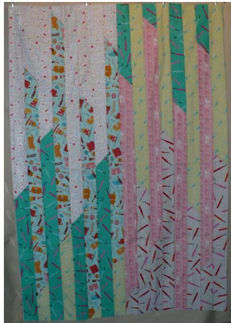
November – Jelly Roll Race