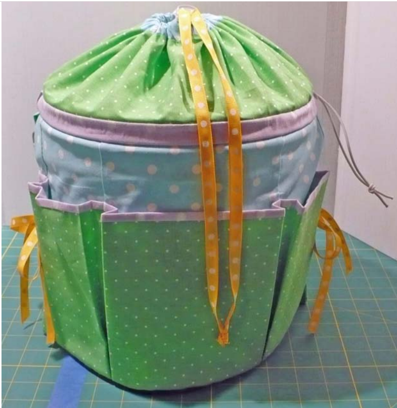
June – Bucket Tool Tote