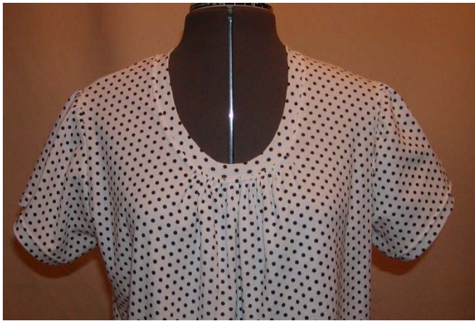
Technique – Working with knits