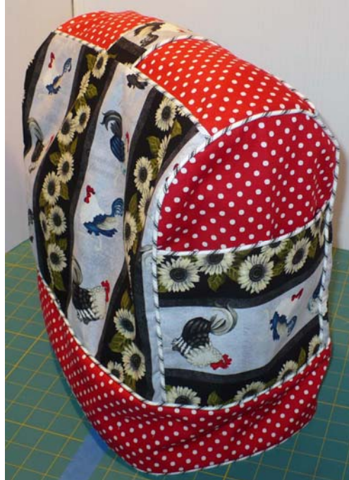
October – Stand Mixer Cover