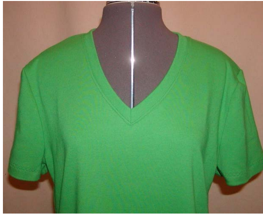
May – T shirts