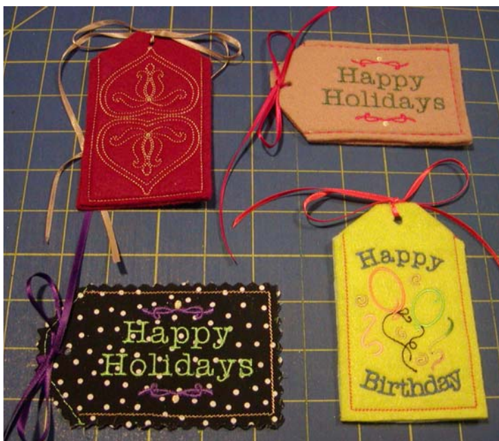
November – Gift card Holder Technique – working with felt