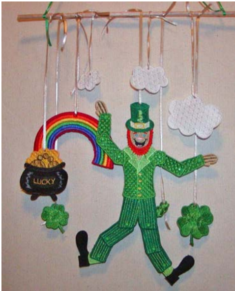
February - Leprechaun Technique – Multi part jointed applique