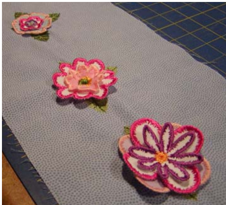
May - Stumpwork Technique – Free Standing Applique