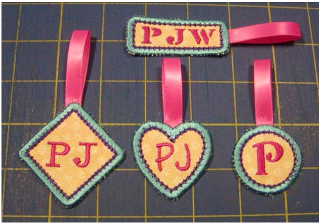
December – Tool Tags Technique – Applique, patches and In the hoop