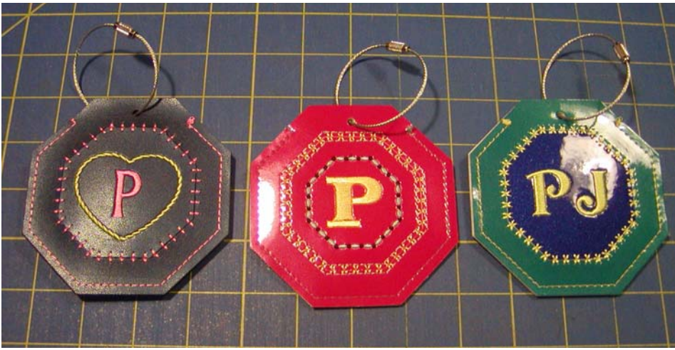
September – Luggage Tag Technique – Multi part applique and in the hoop