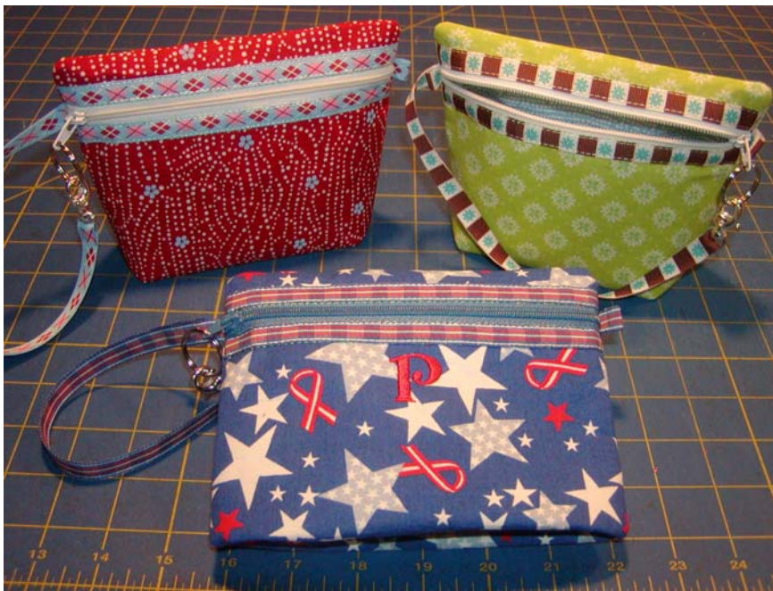
July - Wristlets Technique - Zippers in the hoop