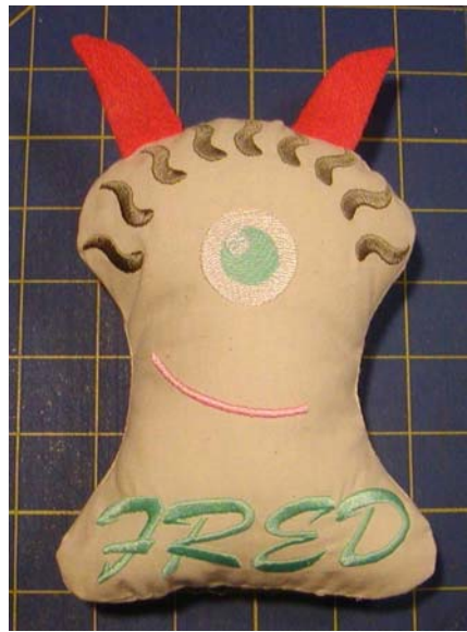
June - Stuffies Technique - combining designs and using text as design elements and motifs