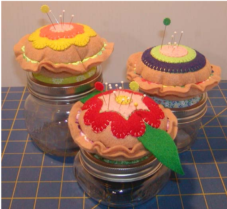
October – Pin cushion Technique – Multi part applique, and In the hoop