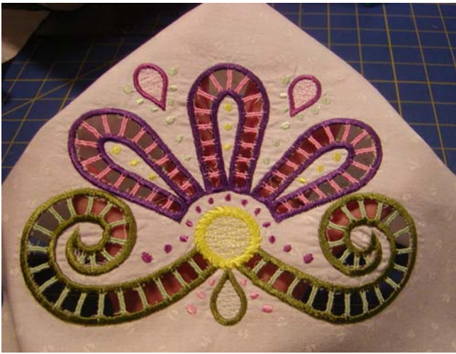
March – Cut Work Technique – Cut work