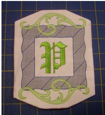
April – Shadow Work Technique – Shadow Work