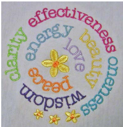
July – T shirt Embroidery Technique – Embroidery on Knits