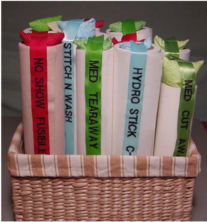
September – Stabilizer Wraps Technique – Embroidery on Ribbon