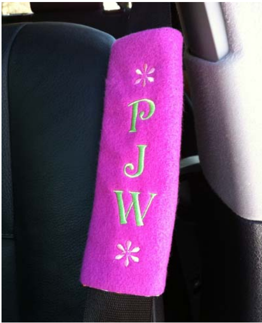
May – Seat Belt thingy Technique – Working with fleece and velcro