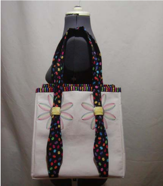
June – Grommet Bag Technique – Working with Snap Grommets