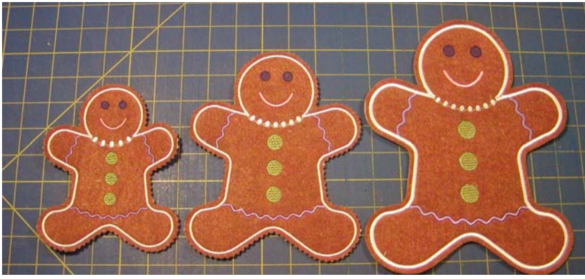
November – Gingerbread boys and girls gift card holders