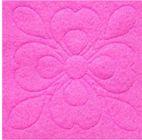
December – Fleece Carving Technique – Fleece Carving