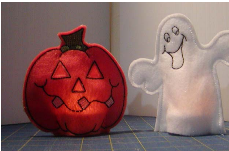
October – Tea Light Toppers Technique – working with felt