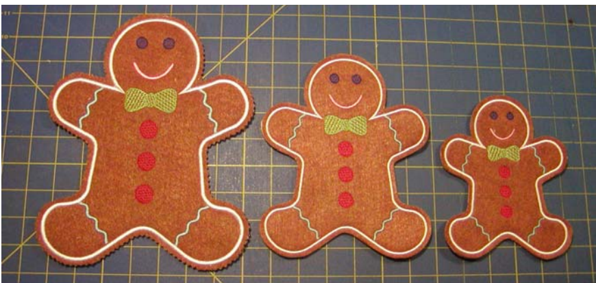
November – Gingerbread boys and girls gift card holders Technique – In the Hoop, working with felt, working on the back side of the hoop