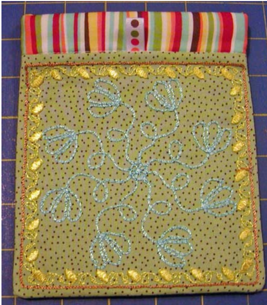
May – Snap Top Case Technique – Bobbin Work