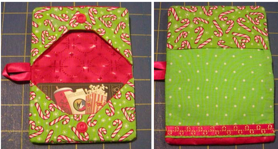
November – Gift Card Folder Technique – combining designs, skipping colors and snaps