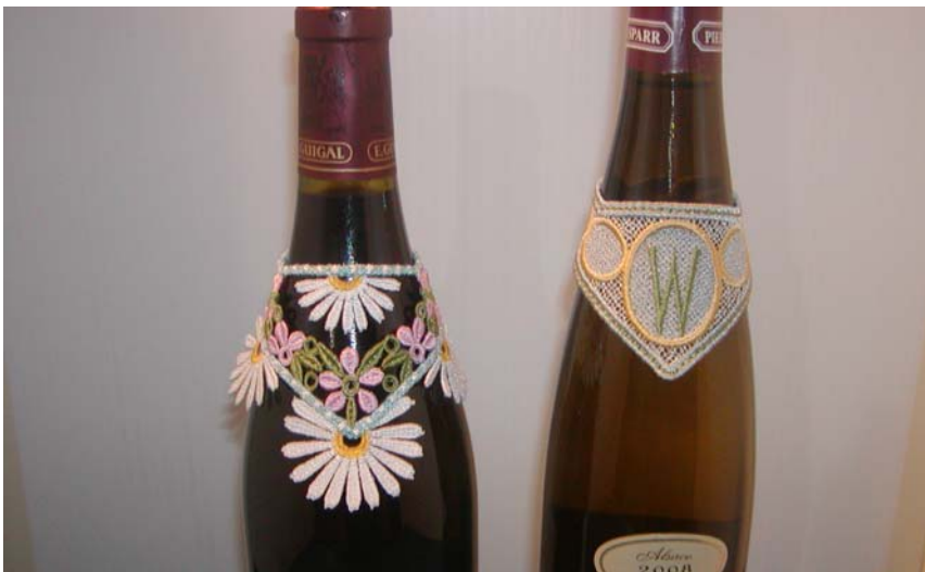
June – Bottle Charm Technique – Lace