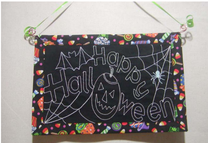
October – Glow in the Dark wall hanging Technique – working with Nite Lite thread and One Stitch Binding