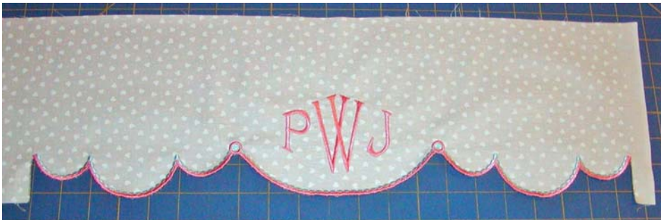
March – Pillowcase Border Technique – Endless Borders