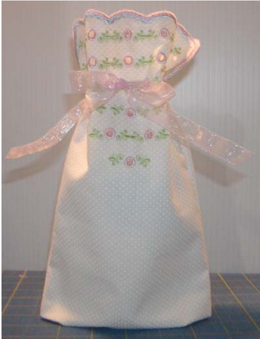
February – Eyelet Bag Technique - Eyelet