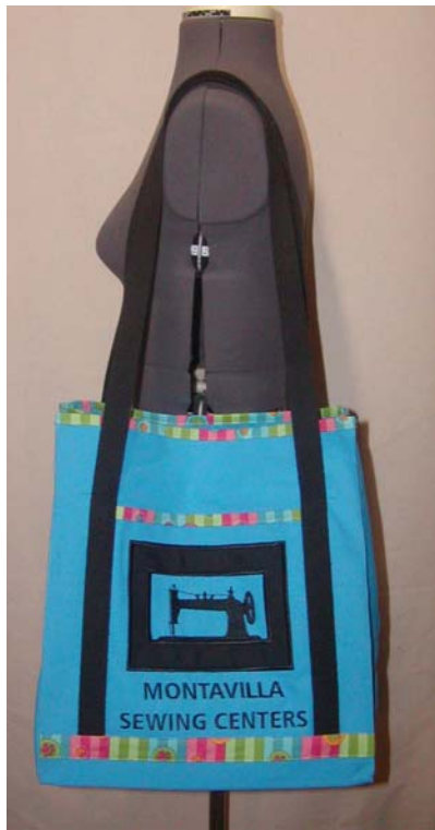
September – Shopping Bag Technique – Bag construction