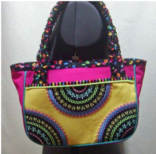
July – Summer Bag Technique – Stitch Stacking