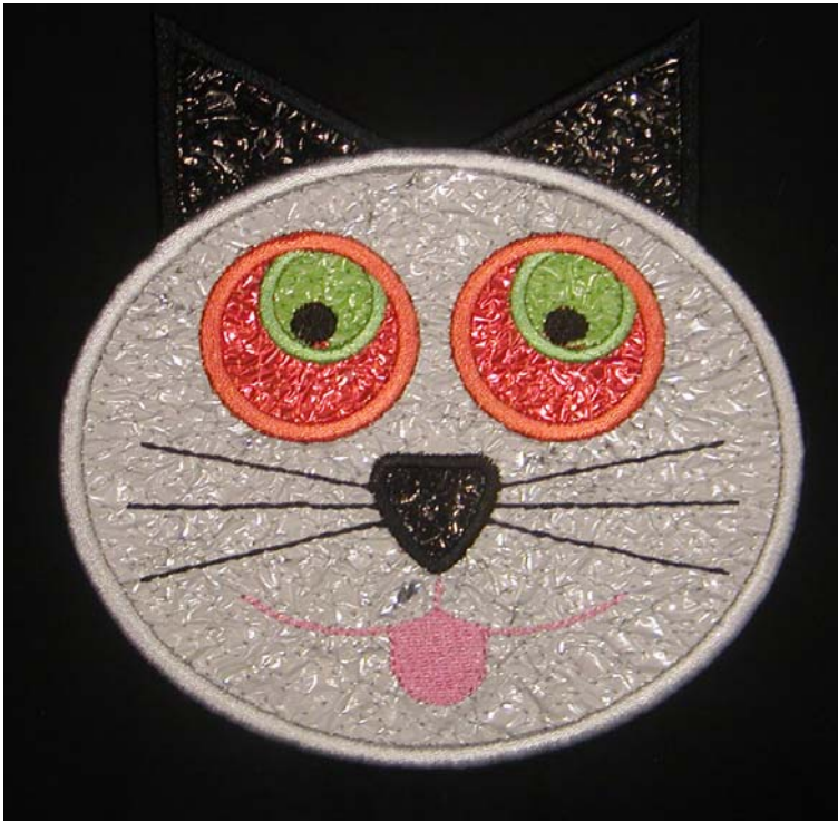
September – Mylar Technique – Mylar