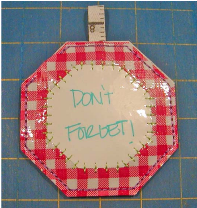
December – Forget Me Nots Technique – working with oil cloth