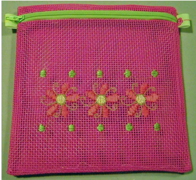
January – Mesh Zippy Pouch Technique – working with pet mesh