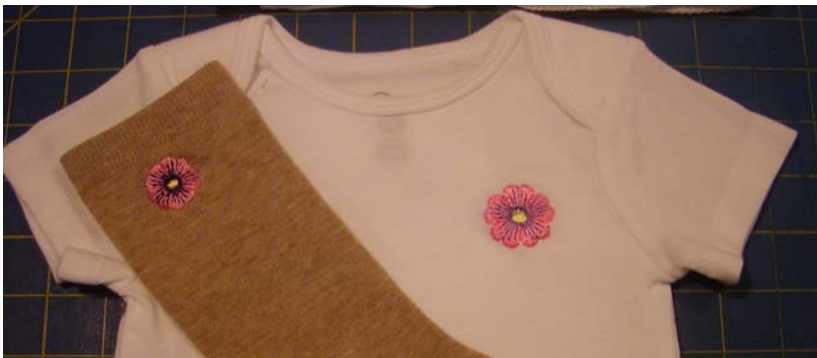
February – Hard to Hoop Technique - Hard to Hoop