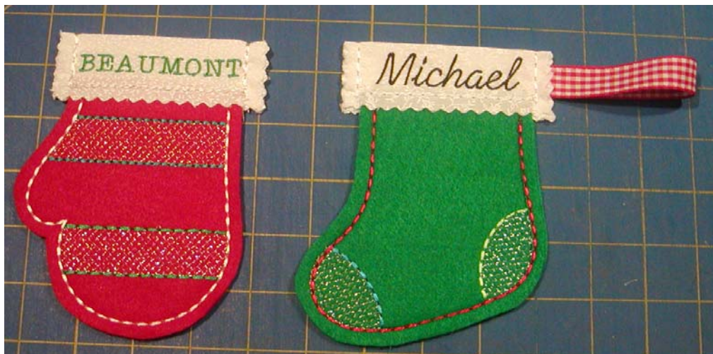
November – Gift Card Holder Technique – working with felt