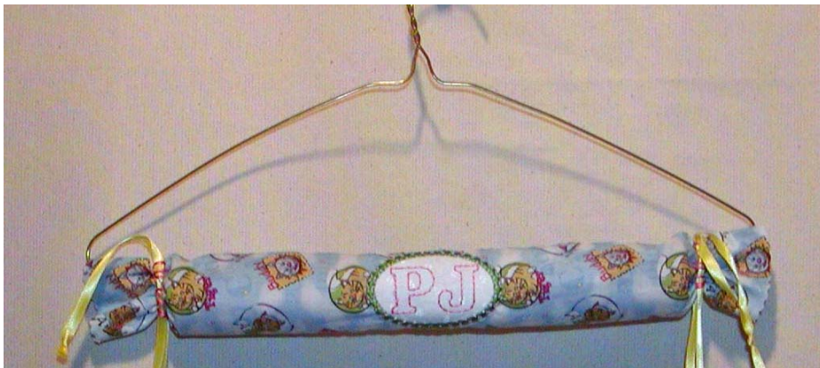
October – Tube covers Technique – Appliqué and ladder stitch