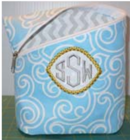
December – Monogram Medallion Applique Zippy Bags

Technique - Applique placement, combining designs, easy box bottoms, sewing on vinyl, working with fusible web