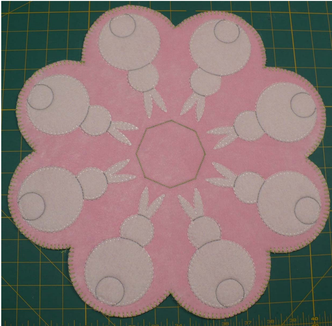
March – Bunny Applique and Banner

Technique - Working with felt, Working with multiple hooppings