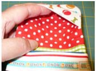
inside top pocket