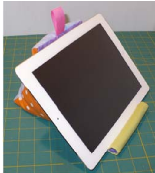
Medium size with iPad 2 nd generation