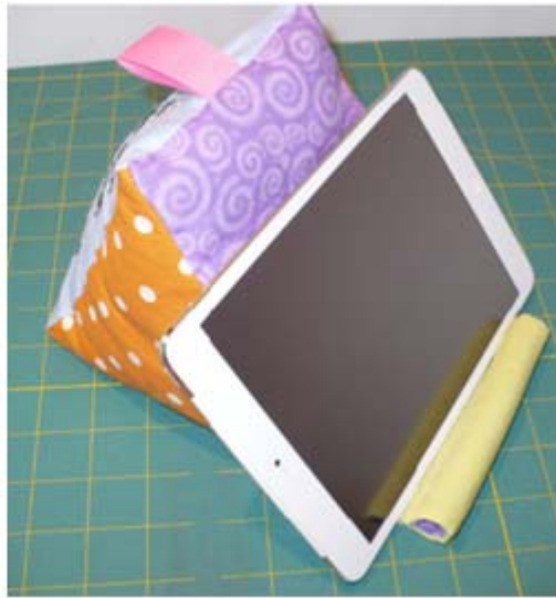
Medium size with iPad Mini