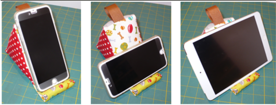
Small – with iPhone 6plus and iPad Mini