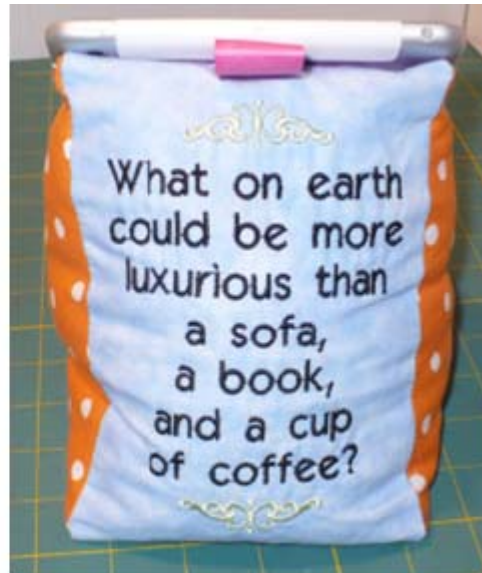
Medium size with iPad Mini