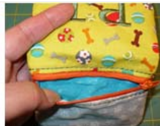
back zippered coin pocket