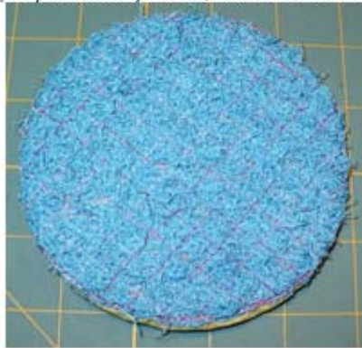
This is the scrubby part

Sample on the left is bleached muslin for the lining and finger pocket Sample on the right uses Rip Stop Nylon – the green is the lining and the purple is the finger pocket The Rip Stop Nylon will dry faster, but the cotton feels better!