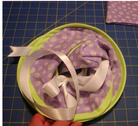
July – Packable Hat

Technique – working with bias and casings