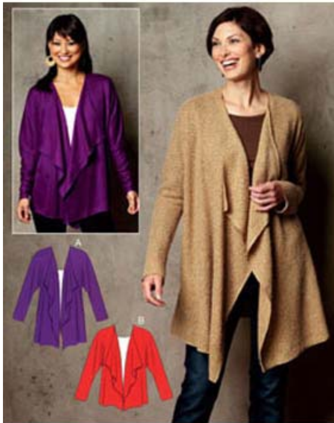
November – Jacket