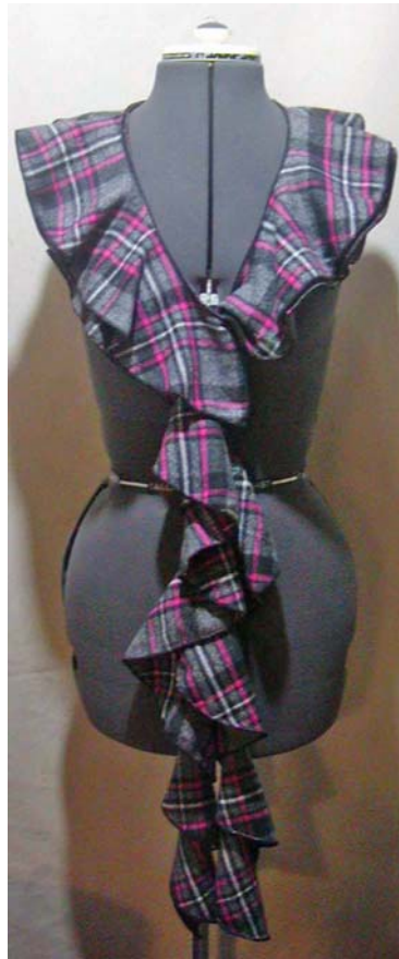
October – Flouncy Scarf