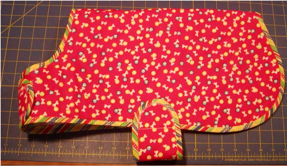
April - Dog Coat