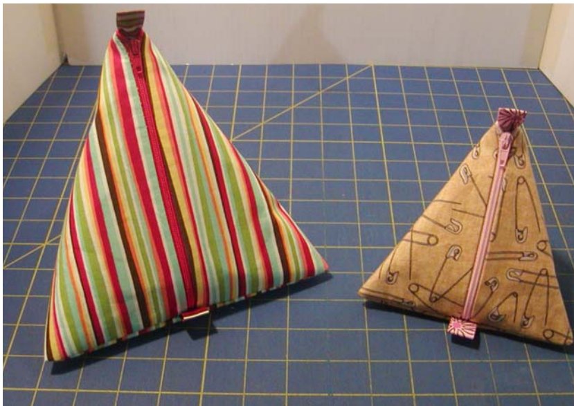
May - Pyramid Zipper Pouch

Technique - setting a zipper with a serger