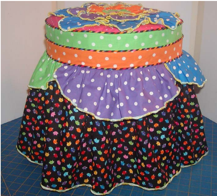
July – Tuffet