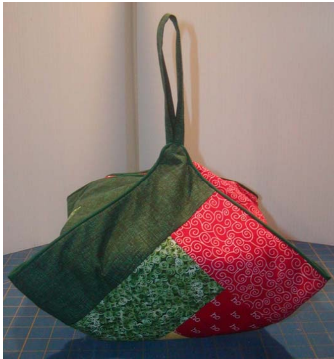
November – Casserole Carrier Technique – piping and piecing