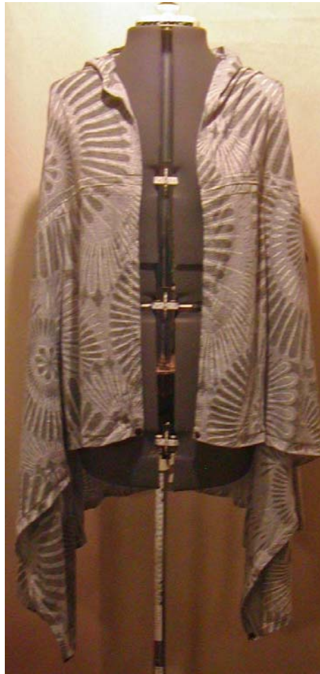
October – Convertible Wrap Technique – flatlock edge finish