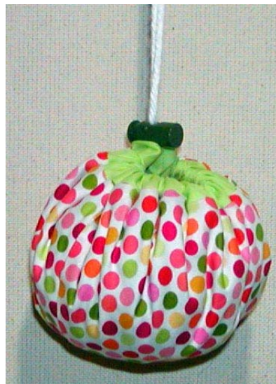
April & May – String Bag

Technique – serger chain fishnet and working with grommets