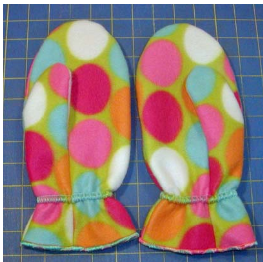
January & February – Mittens & Hoodie Scarf

Technique – rolled hems on fleece, setting elastic with a flat lock stitch