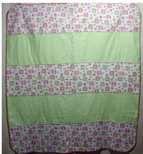
March – Flannel Blanket

Technique – rolled hems on fleece, setting elastic with a flat lock stitch