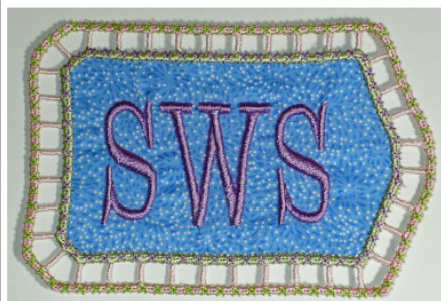
Gift Card Holder Front

This holds the Bag topper “pages” from September