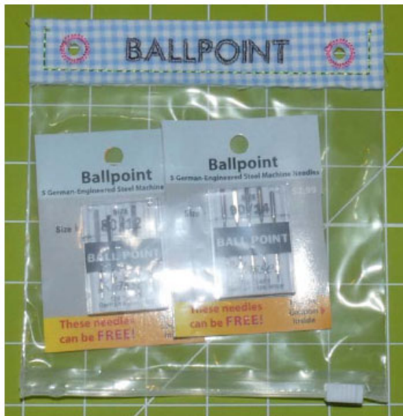
1x6 size with 6 x9 bag cut down to 6x6 This is a "Page" from the Needle Book

Technique - Multi part Applique and Puffy foam