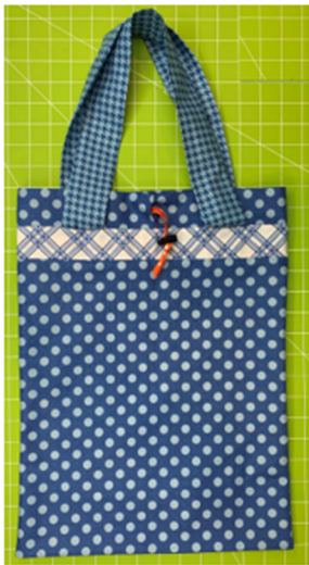
13" wide, 17" tall 6" box bottom

Technique/s – Stitch and Flip Quilting, Piping Corners and Piping Join