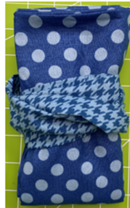
7" x 4" when folded