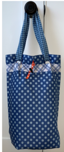
This is filled with 2 bath towels Similar volume to a plastic grocery bag